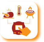
Dual Channel PIT + FOOD (color+ only) temperature control